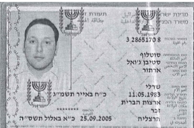
SOTLOFF'S ISRAELI PASSPORT REPORTED BY JEWISH MEDIA

So let the weak-hearted and sick-hearted wake up before defending these “innocent civilians.”