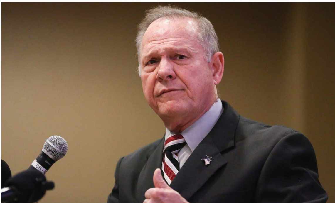
Embattled Judge Roy Moore, speaking on Saturday, said a Washington Post report about him was 'fake news'

newamericanjournal.net/2017/11/politics-makes-strange-bedfellows-but-jesus-not-this/